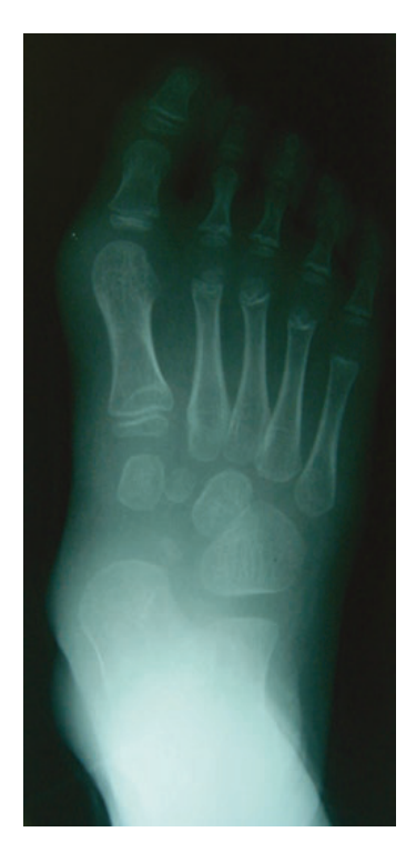
Fig. 15.6 This is an AP radiograph of a juvenile HAV abnormality that demonstrates a "long first metatarsal." Except in cases with brachymetatarsal and other congenital defects or in cases with previous history of trauma or surgery, the authors have noted that there is not a true long first metatarsal. It is a positional abnormality at the time of the "snapshot" of a radiograph. Rather than a "long first metatarsal," the authors submit it is a positional issue demonstrating instability of the first metatarsal. With instability and hypermobility, the first metatarsal is more parallel to the ground, and it appears long; hence it is not physically long, but the position of a fully weight-bearing X-ray gives this impression. Opposite of a long first metatarsal is a short appearing metatarsal radiographically. This occurs in conditions of a stable and plantar-flexed first metatarsal in conditions of a pes caves deformity

tarsals. Often when short and long first metatarsals are discussed, it is the given position of a snapshot view of the first metatarsal. At the time of the radiograph, one needs to ask was the patient full weight bearing, was the patient fully loaded on their foot, was the angle and base of gait accurate, and did the X-ray technician have the appropriate angle at the time of the X-ray? It has been the experience of the authors that when a first metatarsal appears long on an AP X-ray, the metatarsal is elevated or more parallel to the ground (often seen with a flatfoot deformity). When it appears short, the first metatarsal is positioned more in a plantar-flexed position (often seen with a cavus foot) (Fig. 15.6).