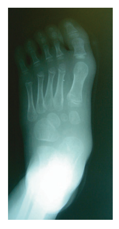
Fig. 15.4 An AP radiograph demonstrating a mild metatarsus adductus with congruent first metatarsal phalangeal joint and a pes planus deformity. Note the dorsal talar-first metatarsal angle

McCluney and Kilmartin have reported the metatarsus adductus angle was not statistically significant and only a causal association of metatarsus adductus in the development of juvenile hallux valgus [30, 37]. Yet neither could exclude metatarsus adductus as a possible predictor of juvenile hallux valgus. Ferrari et al. noted distribution of hallux valgus is significantly different between males and females with and without metatarsus adductus [13]. With normal metatarsus adductus angle, males also had a normal hallux abductus angle, whereas half the females displayed a bunion deformity. In both groups, the rate of hallux valgus increased with abnormal metatarsus adductus angles. Actually, 100% of females with abnormal metatarsus adductus angles had abnormal hallux valgus angles. This study found that when metatarsus adductus was present in females, hallux valgus always accompanies it. Therefore, this coexistence should be assessed during surgical consideration [14] (Figs. 15.4).