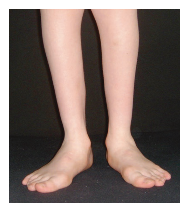
Fig. 15.3 A clinical photo of a juvenile HAV abnormality with a flatfoot deformity

Kilmartin and Wallace noted that the incidence of pes planus is as common in the normal population as in those with hallux valgus [32]. Coughlin showed that only 17% of juveniles with