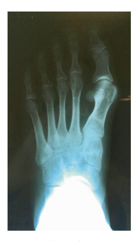
Fig.15.13 An AP radiograph of a patient who had a closing base wedge osteotomy prior to skeletal maturity. The HAV deformity reoccurred

Fig. 15.12 This is a postoperative AP view of a pediatric patient who preoperatively had a flatfoot deformity associated with a HAV condition. This patient had an endoscopic gastrocnemius recession, a double calcaneal osteotomy, a Cotton osteotomy, and a closing base wedge osteotomy