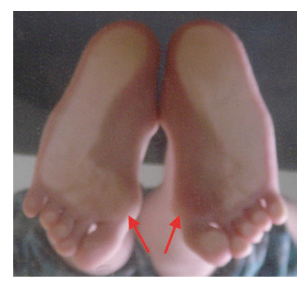
Fig. 15.10 A weight-bearing photo demonstrates the first ray insufficiency (instability/hypermobility) of both feet in a pediatric patient who has been diagnosed with juve-nile HAV

surgeon to obtain an excellent reduction. In essence the authors do not perform these procedure except in very specific scenarios and have found them to be unnecessary.