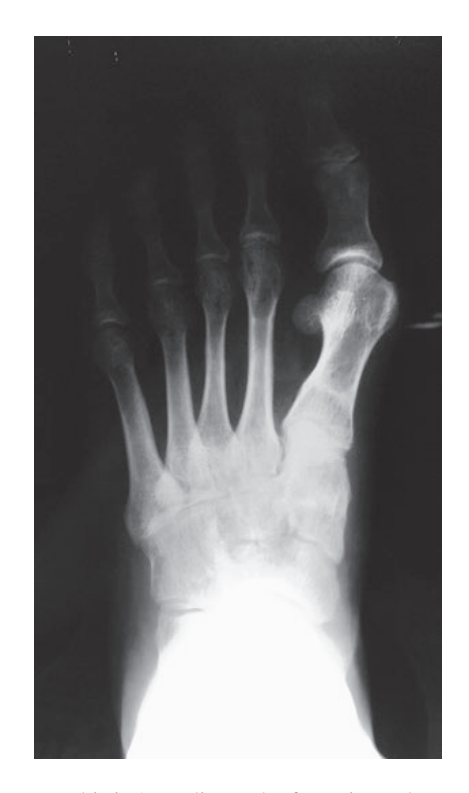
Fig. 15.7 This is AP radiograph of a patient who presents with a reoccurrence of an HAV deformity. Years earlier, when the patient's growth plate was open (skeletal immature), a transverse closing base wedge was performed demonstrating the deformity is much more complex and needs to be addressed

There is little reported use of cuneiform osteotomies in surgical repair of juvenile hallux valgus deformity. The first use was by Riedl in 1908 in which he described a closing wedge osteotomy of the medial cuneiform to reduce the "atavistic" joint surface. This procedure was followed by Young in 1910 who advocated an opening wedge of the medial cuneiform. In 1935,