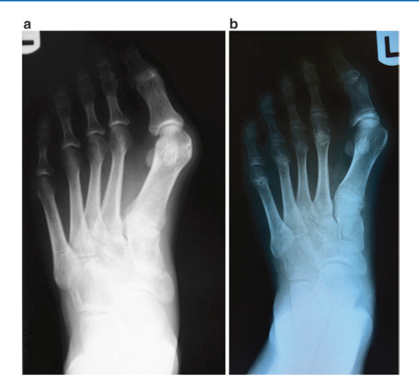
Fig. 15.1 (a) A 15-year-old female who reached skeletal maturity. Note the large intermetatarsal angle, diastasis between the base of the first and second metatarsal and the medial and intermediate cuneiform. Additionally, the hallux valgus angle is large, and this typically incorporates pathological sesamoid position with a frontal plane rotation of the hallux. This patient underwent a Lapidus

even higher male-to-female ratio of 1:14.9 [42] (Figs. 15.1 and 15.2).