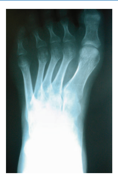
Fig. 15.2 An AP radiograph of a young patient who has reached skeletal maturity demonstrating a met adducts deformity who demonstrates a mild HAV deformity clinically

(Pique-Vidal, McGlamry) shared similar observations that hallux valgus is more common among shoe wearers [37, 42]. Yet, Kilmartin et al. noted hallux valgus increases in children regardless of whether they wear biomechanical orthoses or wellfitting shoes [29]. Footwear may be responsible for the correlation between metatarsus adductus and juvenile hallux abductovalgus in that lateral forces of shoe gear may displace the great toe [14, 44].