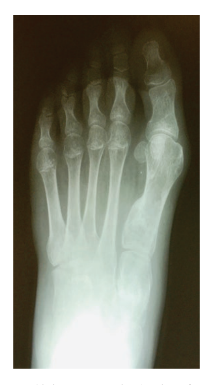
Fig. 15.12 This is a postoperative AP view of a pediatric patient who preoperatively had a flatfoot deformity associated with a HAV condition. This patient had an endoscopic gastrocnemius recession, a double calcaneal osteotomy, a Cotton osteotomy, and a closing base wedge osteotomy

Preoperatively, the patient was diagnosed with a pes planus deformity as well as an HAV deformity. This patient had an endoscopic gastrocnemius recession, a double calcaneal osteotomy, a Cotton osteotomy, and a closing base wedge osteotomy to address all the pathologies