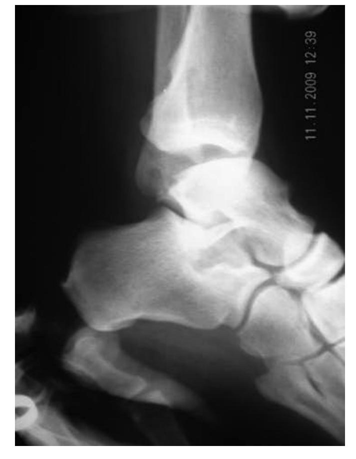
Fig. 2. Preoperative ankle lateral stress radiograph demonstrating a positive anterior drawer sign.

The most commonly injured structures in lateral ankle sprains are the anterior talofibular and calcaneal fibular ligaments (9). Numerous methods have been used to repair these structures (7,10,11). A number of investigators have demonstrated the effectiveness of interference fixation, which entails placement and fixation of a soft tissue graft into a cancellous bone tunnel with the use of a specialized screw that applies the amount of compression necessary to secure the tissue