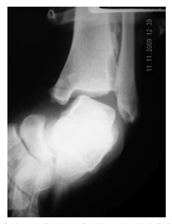
Fig. 1. Preoperative ankle mortise stress radiograph demonstrating a positive talar tilt and instability of the lateral collateral ligaments.

and calcaneal axial views. The peroneus brevis tendon is passed superiorly to the remaining brevis and peroneus longus tendons to act as the retinaculum and is inserted into the calcaneus using the guidewire (Figs. 4 and 5). The ankle is placed into a neutral position at 90° to the leg, and the tendon is advanced into the calcaneal tunnel using the Stryker<sup>™</sup> force fiber wire. Surgeon preference dictates the appropriate amount of physiologic tension to be placed on the tendon. To accomplish this step, the surgeon's assistant applies distal tension to the force fiber wire, which is extending through the plantar aspect of the foot. Next, a 1-mm guidewire is inserted into the calcaneus to act as a cannulated system for the interference screw. Using fluoroscopy to guide placement, a 7.0 \times 2.5-mm absorbable interference screw is introduced into the calcaneus (Fig. 6). The assistant again applies plantar pressure against the calcaneus while pulling on the force fiber wire, and the exposed wire is cut. The deep and superficial layers are then closed according to surgeon preference. The patient is placed in a cast for 3 to 4 weeks and is then started in a physical therapy program.