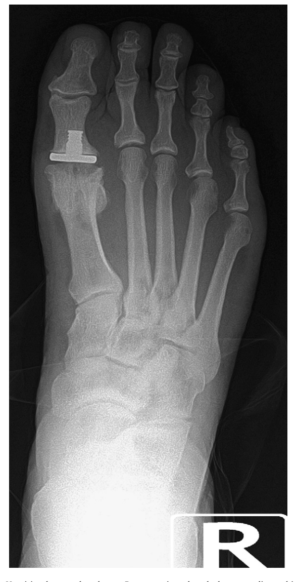
Fig. 2. Hemi-implant arthroplasty. Postoperative dorsal-plantar radiographic view demonstrating result of hemi-implant arthroplasty of first metatarsophalangeal joint.

of the study, 2 sites were withdrawn by the study director. One of these sites was withdrawn because of the lack of study progress and subject enrollment. The other site was withdrawn because multiple pages of data were either not collected or missing. The data collected from these sites were not used in the final analysis. Two replacement sites were added according to the same criteria as listed. After an interim power analysis was conducted, an additional investigational site was added to increase the power of the study. Hence, the data from 6 sites were used for the final statistical analysis.