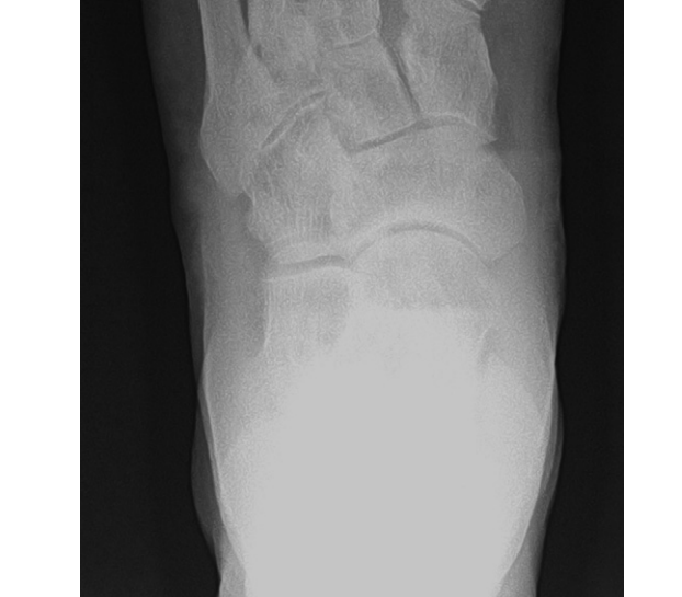
Fig. 1. Arthrodesis. Postoperative dorsal-plantar radiographic view demonstrating result of arthrodesis of first metatarsophalangeal joint using a plate and a single partially threaded cortical lag screw.

Robust long-term studies examining the efficacy for the surgical treatment of end-stage hallux rigidus are lacking. There are conflicting and unclear published reports regarding arthrodesis, hemi-implant arthroplasty, and resectional arthroplasty. To our knowledge, no large, long-term published outcome studies have directly compared these 3 surgical techniques. The present study